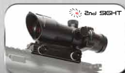
Red Dot Sight