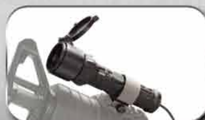
Combat Lite G&G 6 Tactical Pack