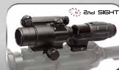
M4 Dot Sight(Left) Model No:CM-17-014