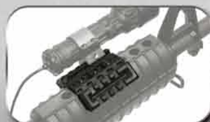
Tactical handguard rail for CM M16