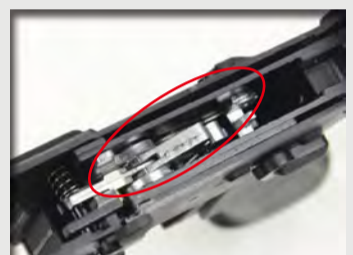
Apply household oil in the area circled in red.