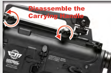
Disassemble the Carrying Handle Turn the knobs counterclockwise