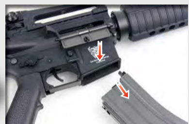
Remove the Magazine