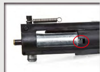
Apply silicone oil in the area circled in red.