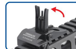
Front Sight - Flip up