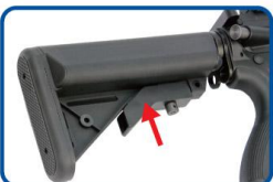
Press the stock release lever to unlock.