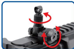
Windage knob (left / right adjustment) Elevation knob (up / down adjustment)