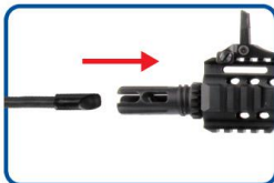
Return the hop up dial to normal position and insert the cleaning rod from the lead edge of the inner barrel.