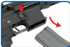
Remove the magazine.