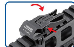
Front Sight - Press the button and Fold down