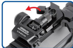
Rear Sight - Flip up