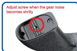
Adjust screw when the gear noise becomes shrilly