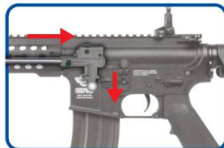
Be aware to have the rod facing down and reaching to the end, and remove clogged pellets.