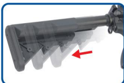
Adjust the position ( 6 position ).